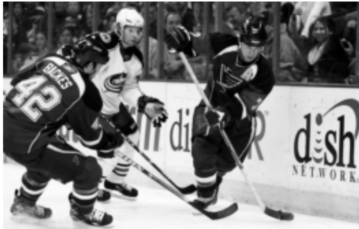
David Backes (42) and Keith Tkachuk (right) show the Blues' work ethic against Columbus.

said, "I think guys individually have found that desperation in their game, and it's played a huge part in the team success."