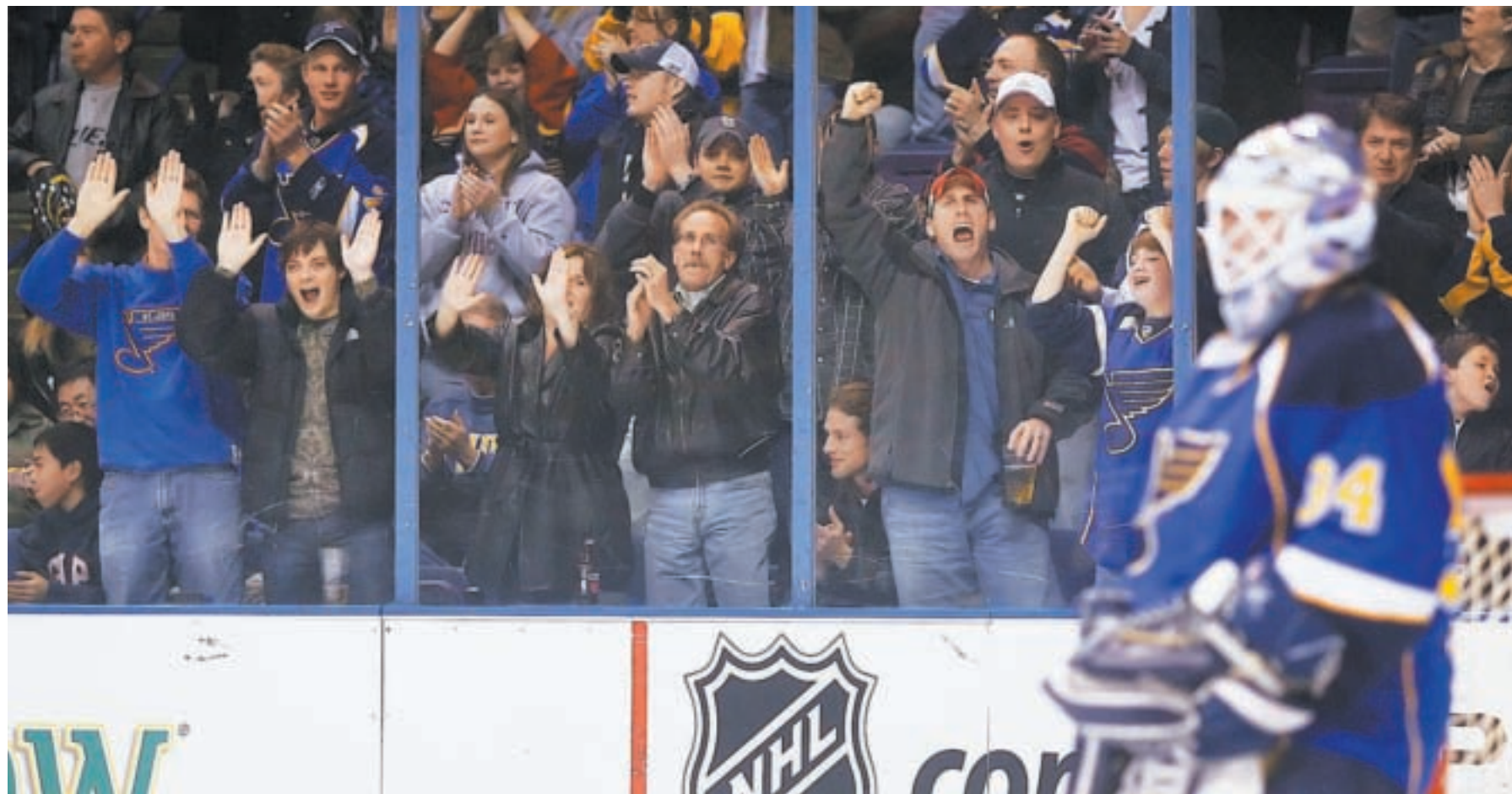
The fans have returned this year in greater numbers to cheer on goalie Manny Legace, who is backstopping the team's bid for the playoffs.