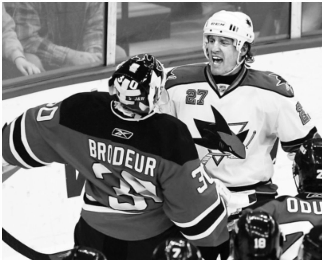
New Jersey goalie Martin Brodeur is shoved by San Jose's Jeremy Roenick as the two exchange words Wednesday night. The Devils defeated the Sharks 3-2.